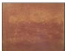
MISSION BROWN CS-700